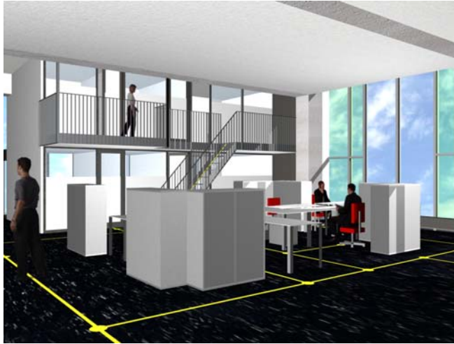
Figure 1. Simulated office environment of the test floor.

and Planning; the floor where the Design Systems group is housed (see Figure 1 ). The second chair located on this floor, Structural Design, was willing to participate in this experiment.