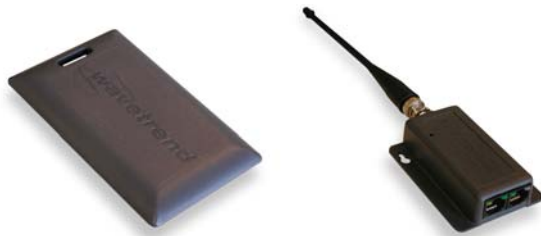
Figure 3. RFID tag and reader.

A relative new technology called RFID (Radio Frequency Identification) could be the key for a non obtrusive way of collecting data about human movement and activity behaviour. Using this system, participants only have to carry a small device and the RFID system automatically registers their movements. During the observation period participants themselves do not have to perform any additional actions besides performing their normal activity behaviour. Due to the passive nature of this system the behaviour of people is only influenced in a limited manner and probably only the most in the beginning of the experiment. This system results in observed data about the daily movement behaviour with a relative high degree of precision.