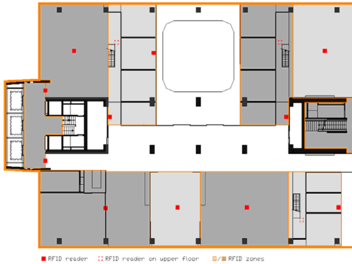
Figure 4. RFID zone layout.